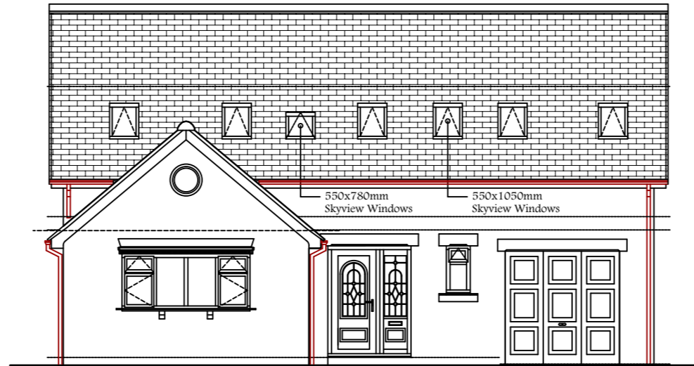
Proposed South East Elevation