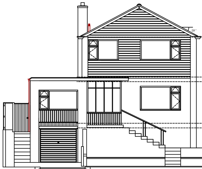
Existing North West Elevation